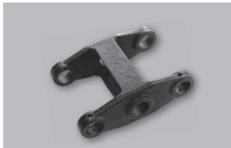
Art.-Nr. 0630054 / 0635611