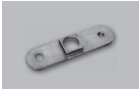
Art.-Nr. 5061146 / 5096263